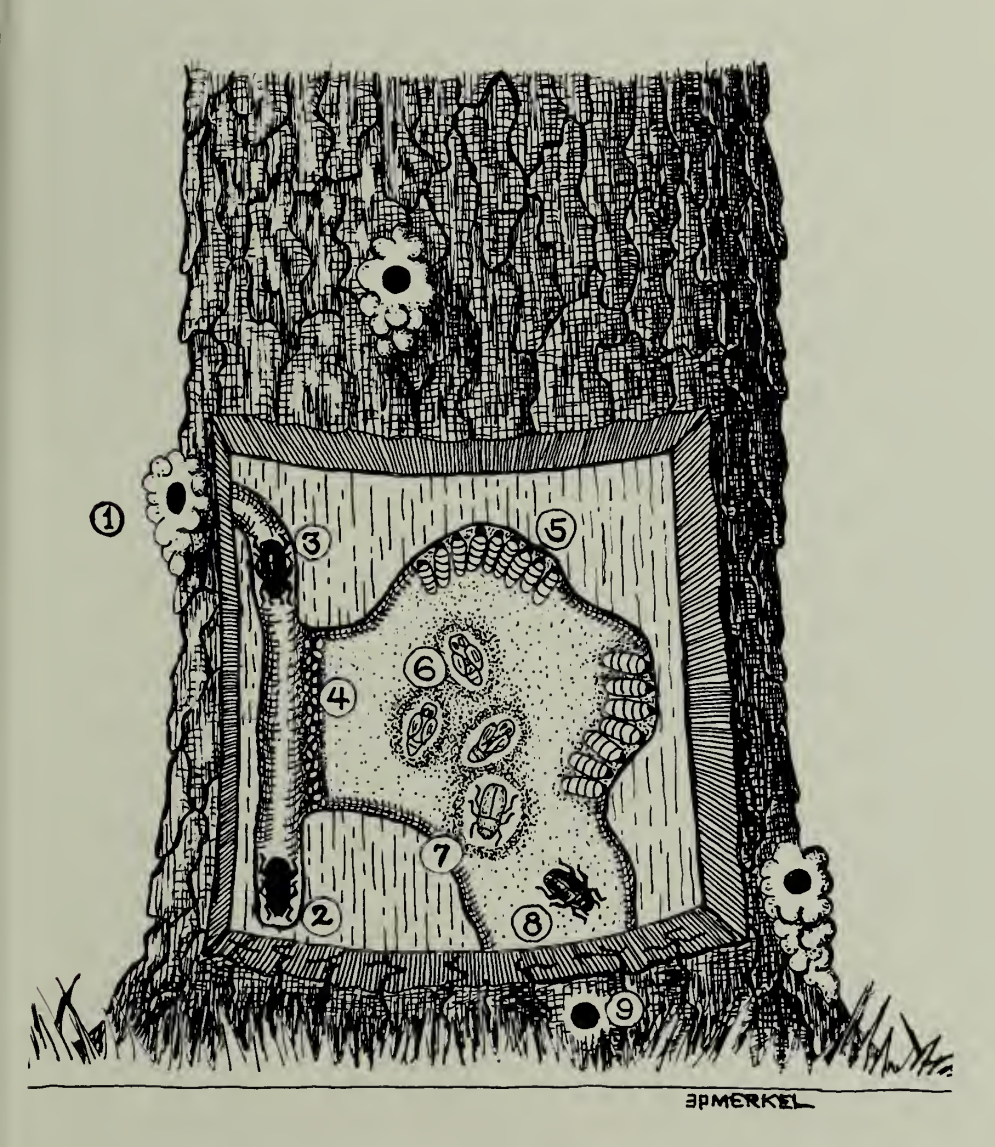
Figure 3. --Development of the black turpentine beetle in the inner bark of southern pines.

During construction of the egg gallery in the inner bark (Fig. 3), the attacking beetles must work to keep from being overwhelmed by the flow of gum; so this gum is continually pushed out of the entrance hole forming the pitch tube.