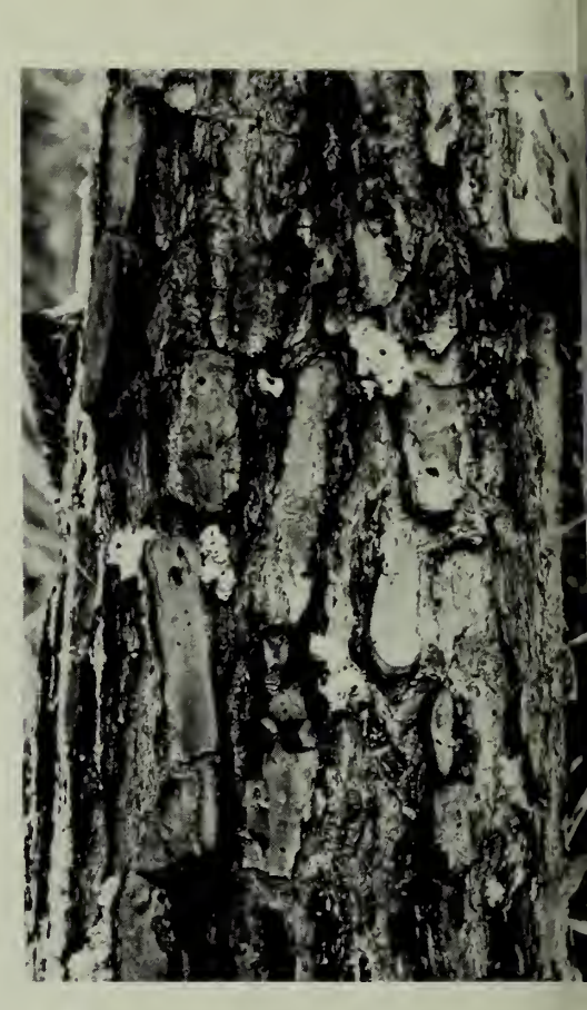
Figure 2. --Typical pitch tubes made by black turpentine beetles when attacking the lower trunks of southern pines.

Before appropriate control procedures can be started, one must determine whether BTB or other bark beetles are attacking the pines. The best clues for identifying the presence of BTB are the large pitch tubes (Fig. 2) that are found within the lowest three to six feet of the tree trunk. Pitch tubes resulting from the earliest attacks, however, usually occur within 18 inches above the ground. The pinkishwhite to reddish-brown pitch tubes have a diameter about the size of a 50-cent piece and form on the bark surface at the point where the beetles bore through the cuter bark into the pitchy white inner bark next to the wood.