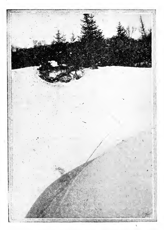
The Otter's Trail Overland

I hastened back to camp, exchanged the pistol for the rifle, put a blanket and two days' rations in the haversack and started.