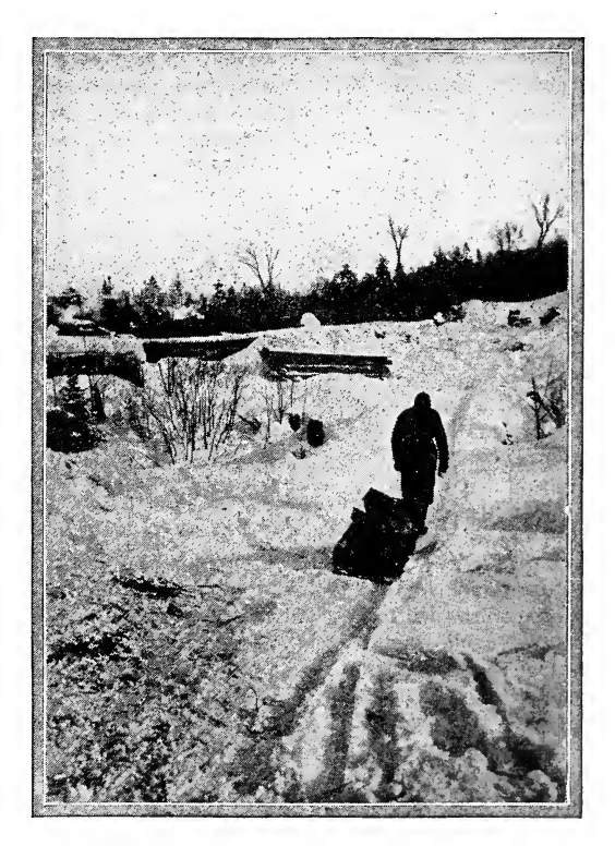
Pulling into the Lumber Camp

Knowing that much of the country had been cut over, Pard and I started in on the north side twenty miles or thereabouts above the head of the river, with the idea of getting into vur-