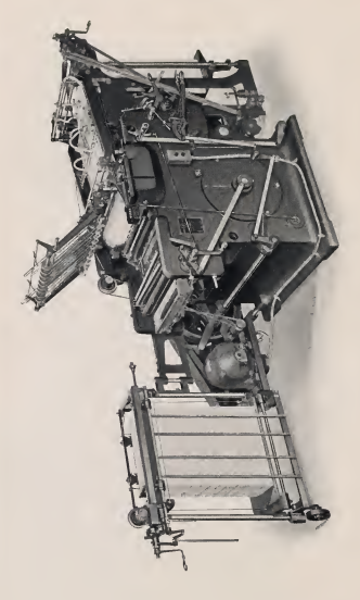
Delivery Stoung Back, Delivery Carriage Raised