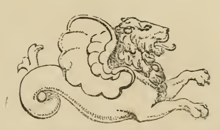
Ars probat artificem.

AUTHOR OF "THE SCIENCE OF MODERATION," "METRONOMY, OR THE SCIENCE OF PROPORTION," ETC., ETC.