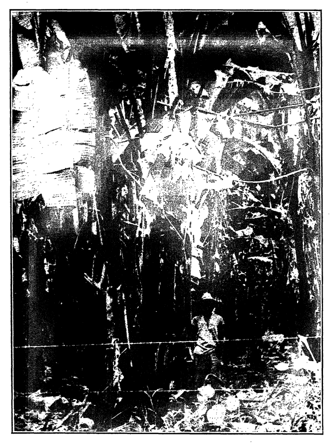
Abacá (manila hemp), Sinaba and Tangongon varieties, Davao, Mindanao.

vation of 1,000 meters (3,280 feet.) Cold climates are detrimental to the plant, both in regard to the extent of its growth and the development of its fiber. Extreme heat, on the other hand, appears to affect