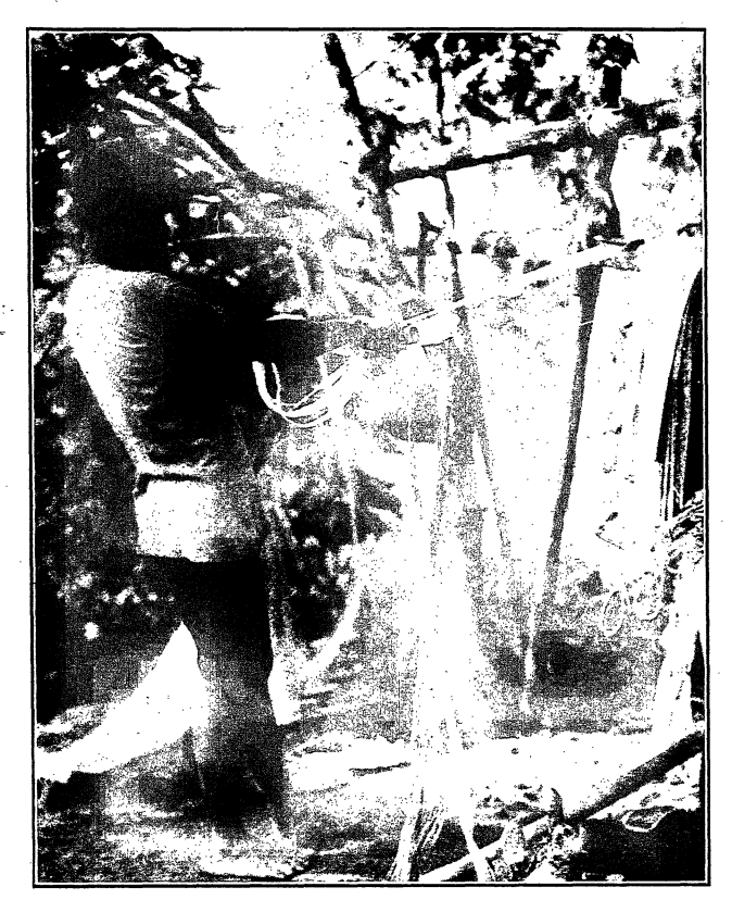
Stripping abacá (manila hemp), second process, Davao, Mindanao.

quent cultivation is estimated at P10 to P12 ($5 to $6) per acre. The cost of harvesting, fiber extraction, and marketing of the product ranges from P175 to P200 ($87.50 to $100) per ton, or P87 to P100