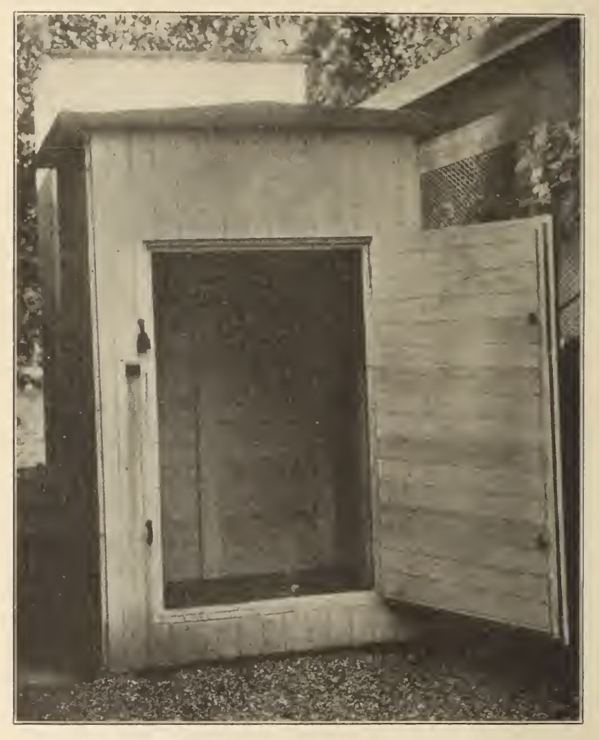
FIG. 3.-Fumigator used for stored products infested by insects. (Author's illustration.)

acid gas. If bisulphid of carbon is used, it should be at the rate of 3 pounds to 1,000 cubic feet of air space, including the potatocs; 1 ounce to a barrel of 96 pounds' capacity would not be excessive. With an exposure of not more than 24 hours, no harm should be done to the potatocs for planting. The bisulphid should be evaporated in