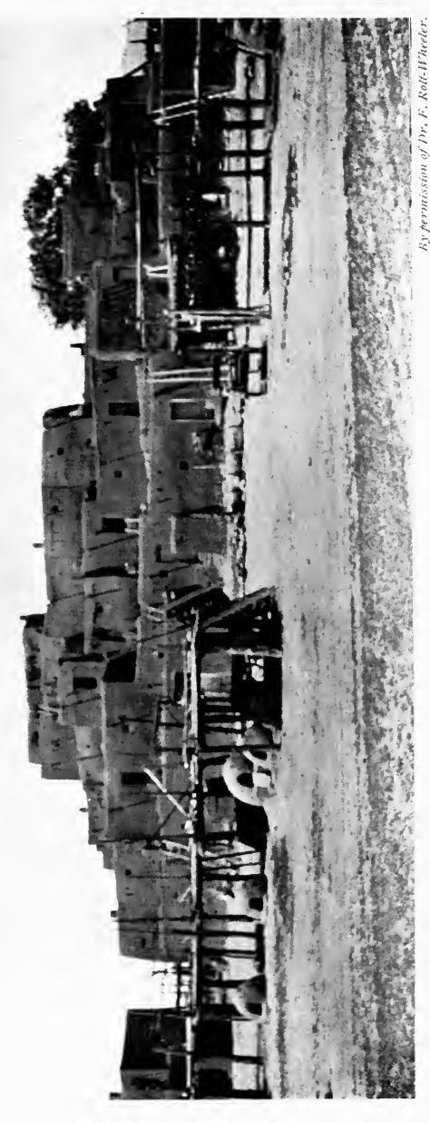
PUEBLO OF TAOS.