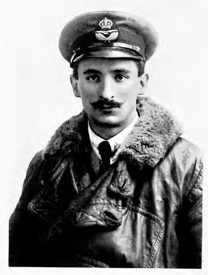
PORTRAIT OF THE AUTHOR.