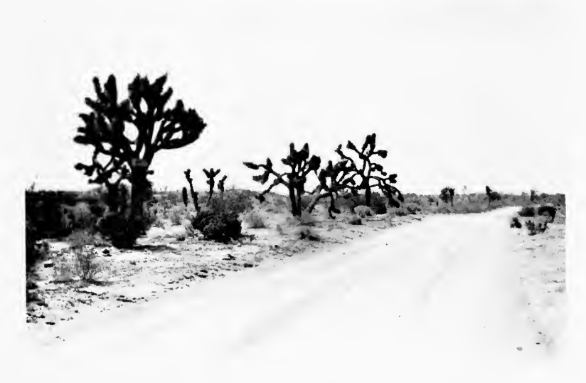
CACTUS TREES NEAR SAN BERNARDINO, CALIFORNIA.