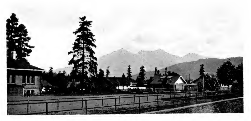
SAN FRANCISCO PEAKS FROM FLAGSTAFF.