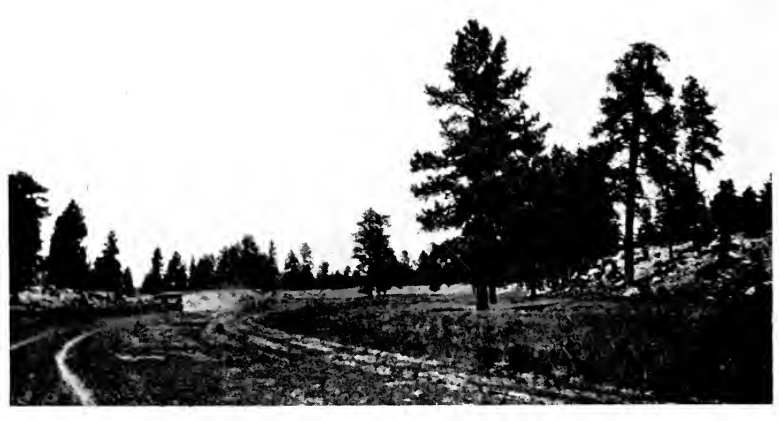
m m a