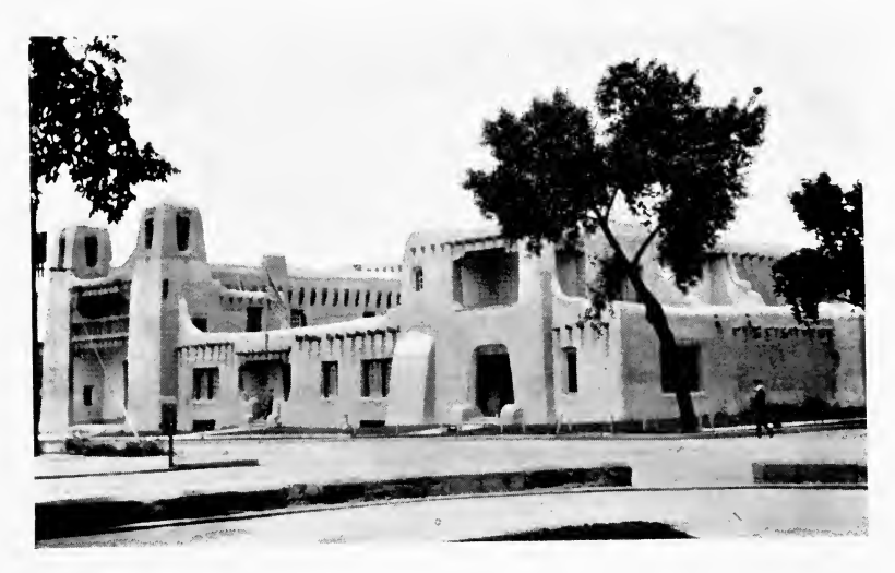
THE ART MUSEUM AT SANTA FÉ.