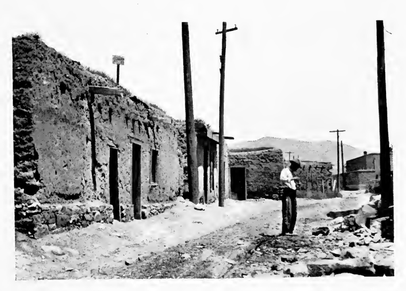
The Oldest House in America, at Santa Fé.