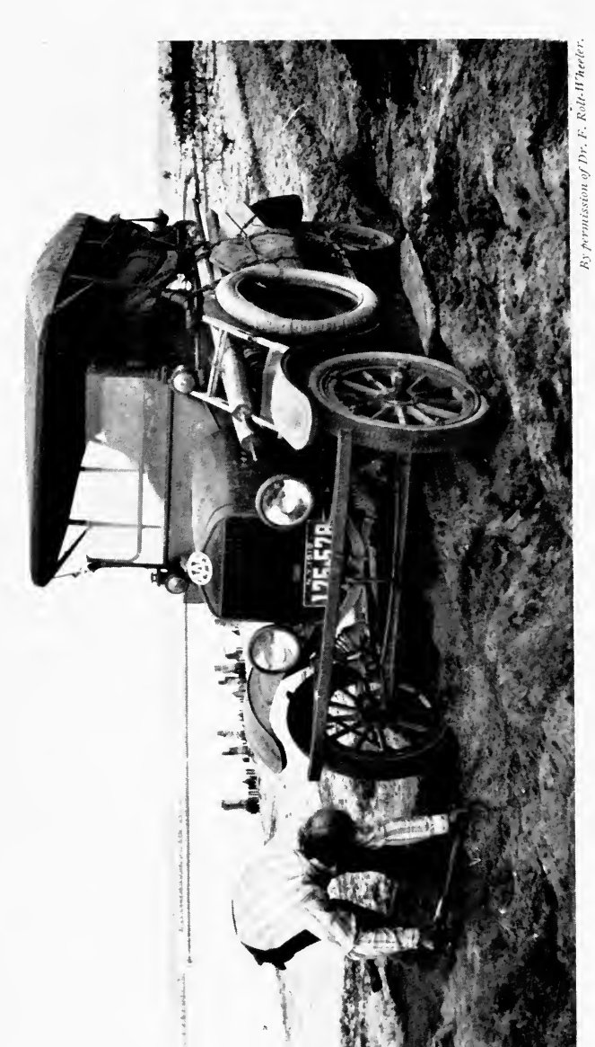
A COMMON OCCURRENCE,