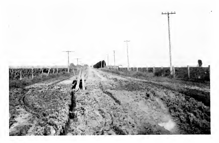
AN AWKWARD STRETCH OF ROAD IN INDIANA.