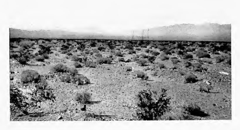
IN THE MOHAVE DESERT.