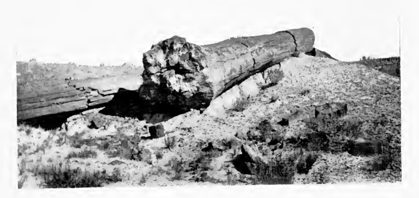
A PETRIFIED LEVIATHAN.