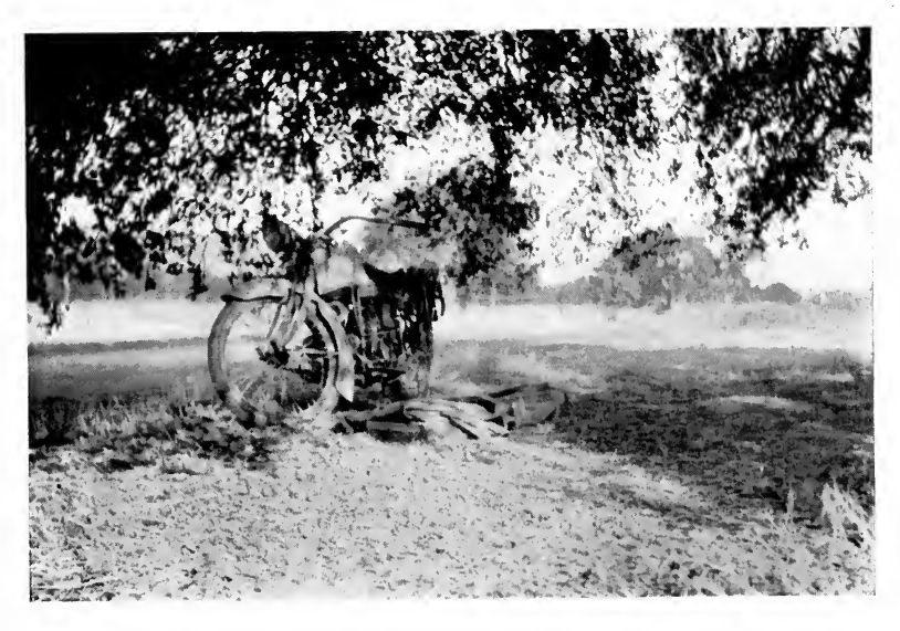
THE MIDNIGHT COUCH.