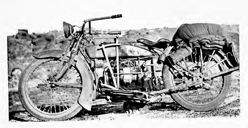
"LIZZIE" IN THE PETRIFIED FOREST, ARIZONA.