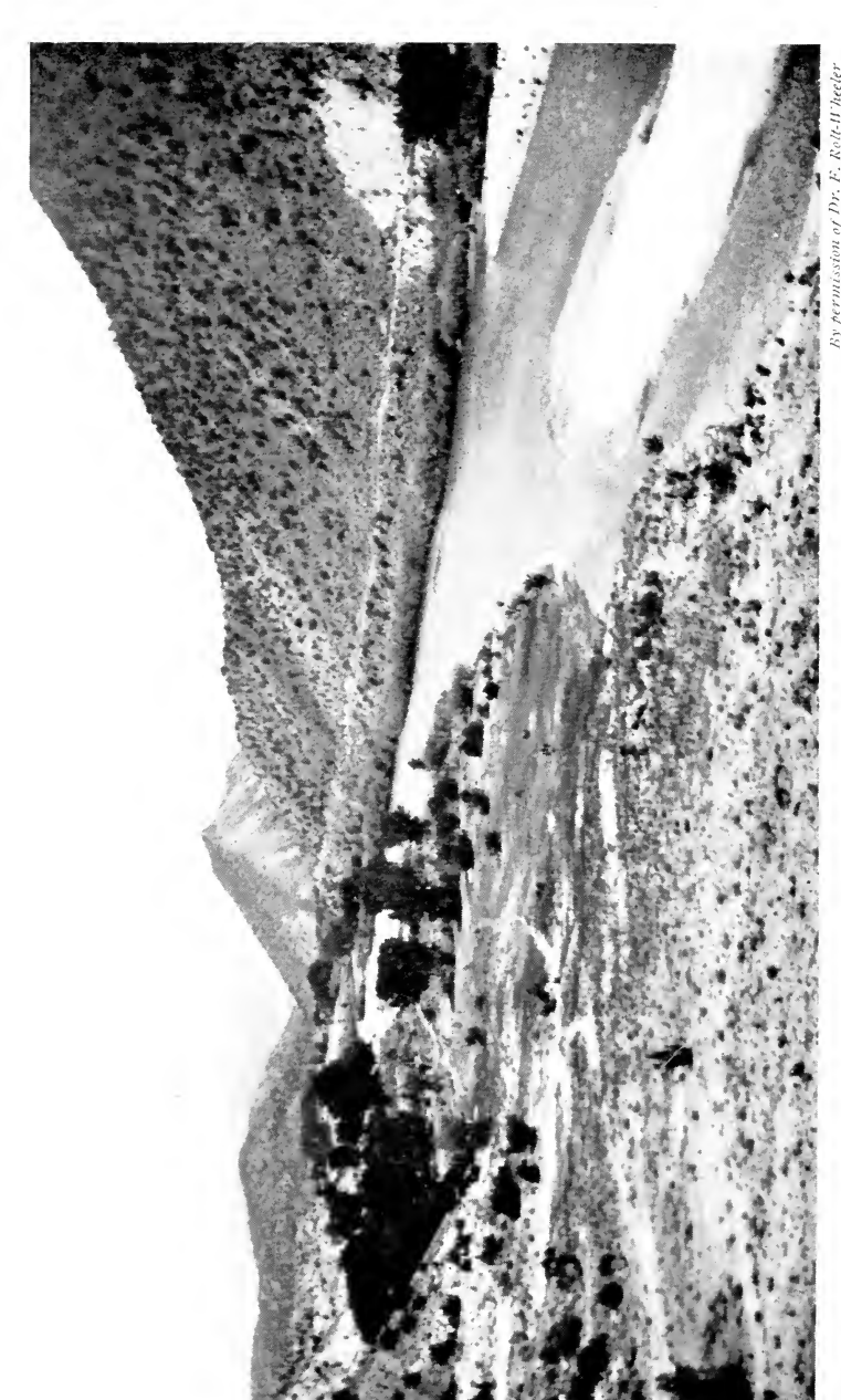
THE RIO GRANDE, NEW MEXICO.