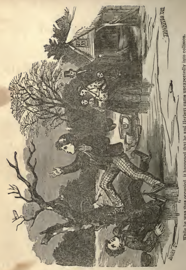
While he was thus occupied, it happened that he and Herbert came unexpectedly into collision.